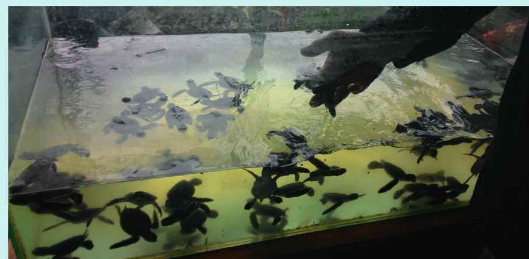
The last stage of exploitation: members of ProFauna recently reported a pet shop in Bandung, West Java, which offers sea turtle hatchlings for sale.