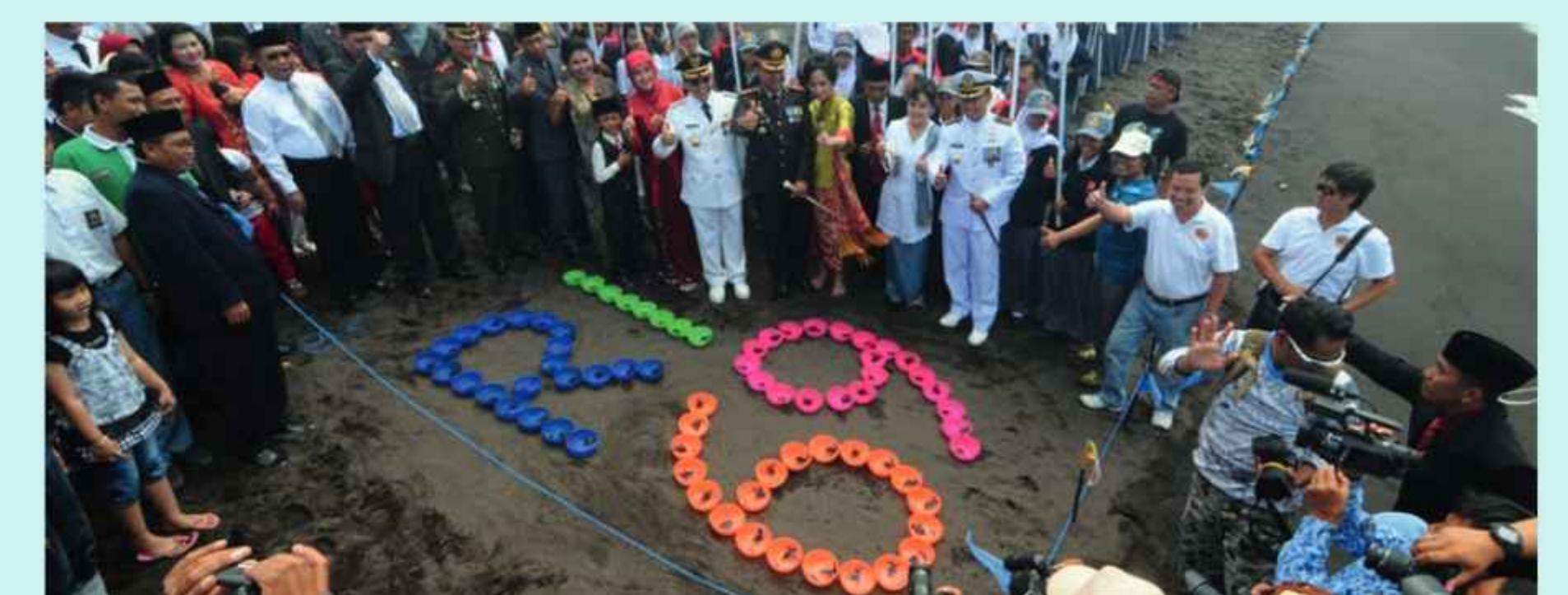
Questionable education: which lesson are these pre-school children supposed to learn? Each kid is holding a water-filled plastic bag containing one hatchling.