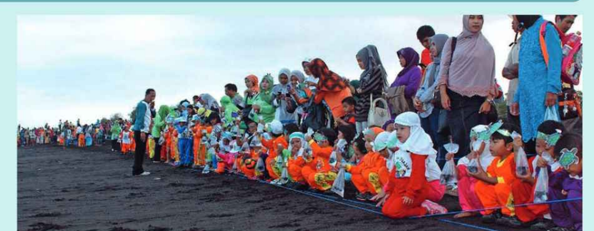
Hatchlings releases as a mean to obtain media attention: the symbol of the 69th anniversary of Indonesian independence on August 17, 2014, is shaped by colored, water-filled plastic bowls; each of them contains a hatchling which will be released during the ceremony.